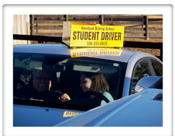
OK, this is just scary!

RSVP by March 10th to highcaliberstables@hotmail.com