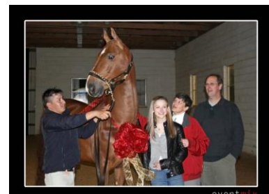
Reedann's Heir to Glory McGee Bosworth